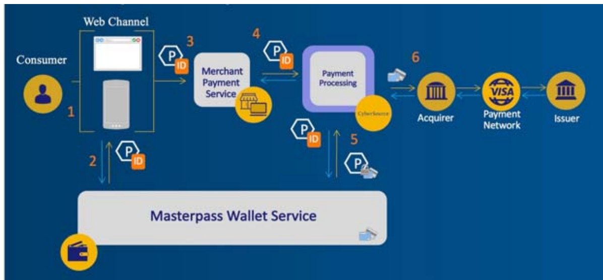
Figure 1 Masterpass Payment Flow